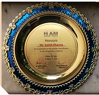
HONOURED AT HI-AIM CONFERENCE+EXPOSITION FOR CONTRIBUTION TO THE HOSPITALITY INDUSTRY