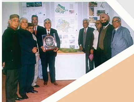
RECIPIENT OF PRIME MINISTER'S NATIONAL AWARD FOR EXCELLENCE IN URBAN PLANNING & DESIGN