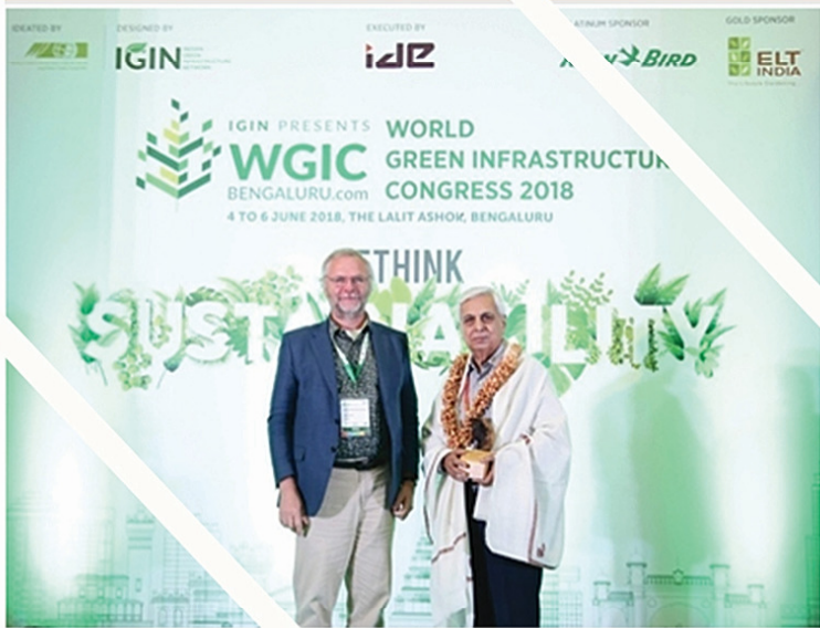
AWARD OF HONOUR AT THE WORLD GREEN INFRASTRUCTURE CONGRESS