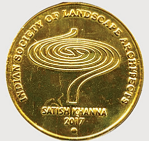
INDIAN SOCIETY OF LANDSCAPE ARCHITECTS (ISOLA) GOLD MEDAL BESTOWED FOR LIFETIME ACHIEVEMENT